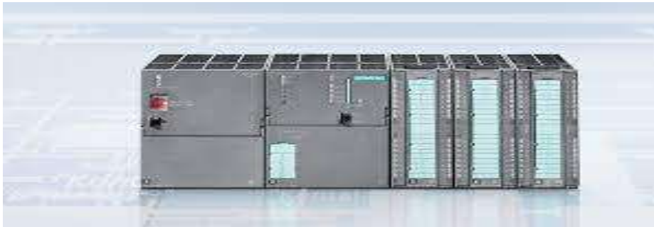
S7-300 SIMATIC SIEMENS PLC

OFFICE-ADDRESS: HEMAK CONTROLS NEW GOODS SHED ROAD CHINTAMANI CHAMERS 1st CROSS BELGAUM CONTACT NO :9663929707