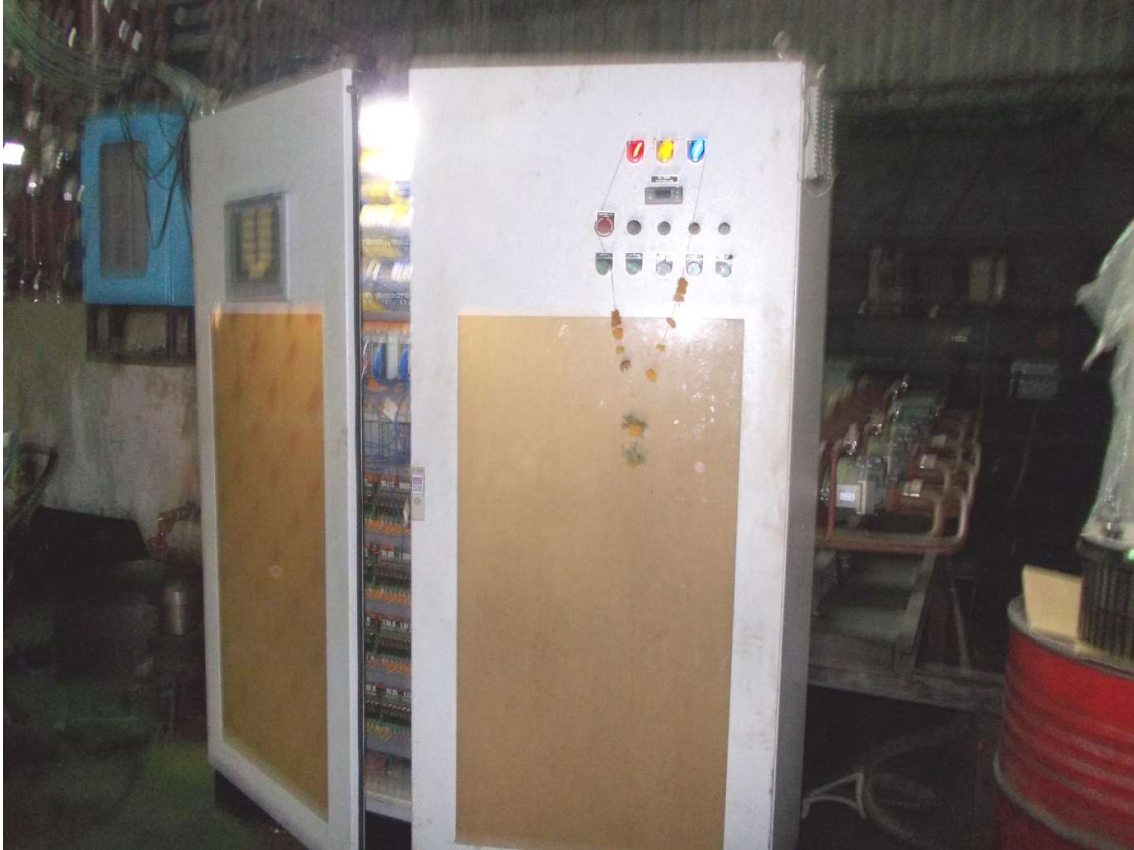
PLC CONTROL PANEL